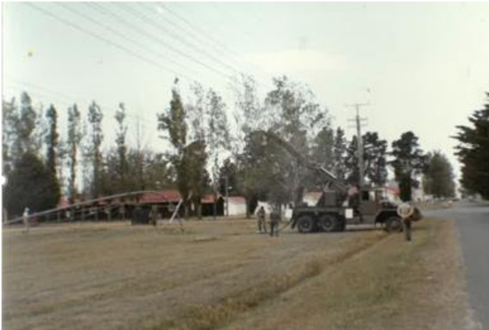
M543 recovery task