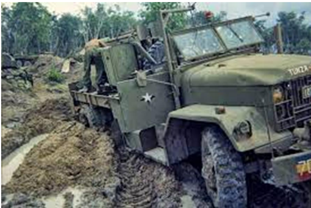
Tunza Gutz undertaking Recovery task in South Vietnam

Tunza Gutz was returned to Australia on 14 September 1968, and is currently on display in the Army Museum Bandiana.