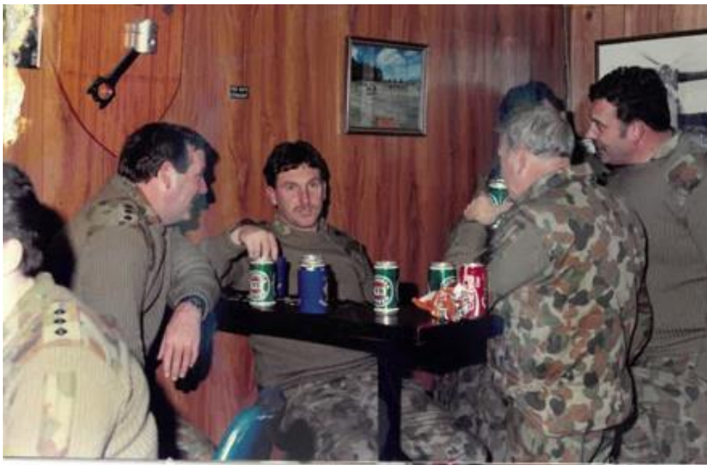
Deep discussion in the Craftsman Club