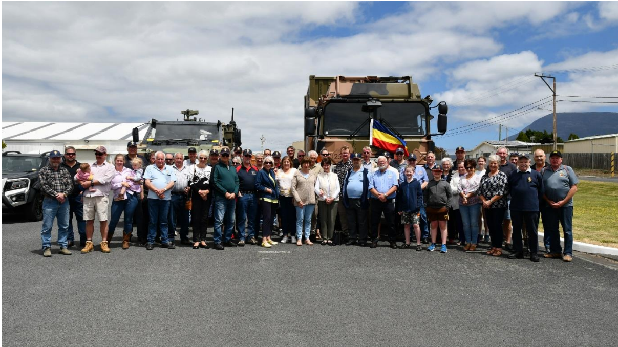
RATs on parade

During the course of the day the AGM was held and, as no surprise the current Committee was re-elected unopposed. Your list of Committee is highlighted on page 1 of the Newsletter FYI.