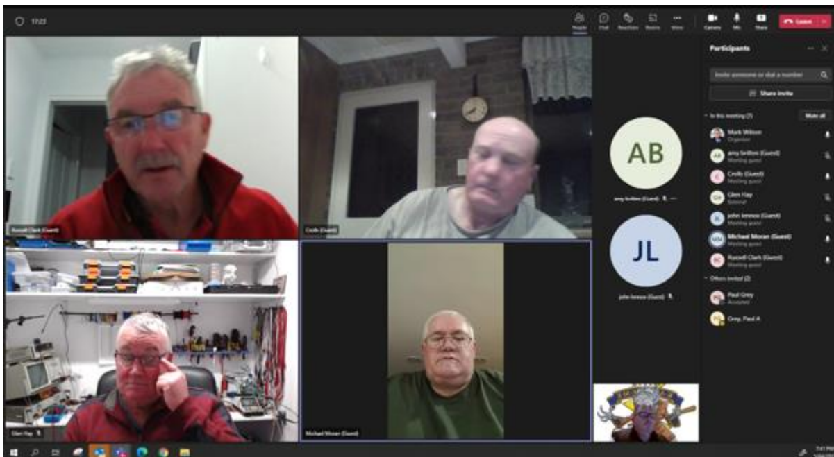
Your Committee during their first TEAMs meeting