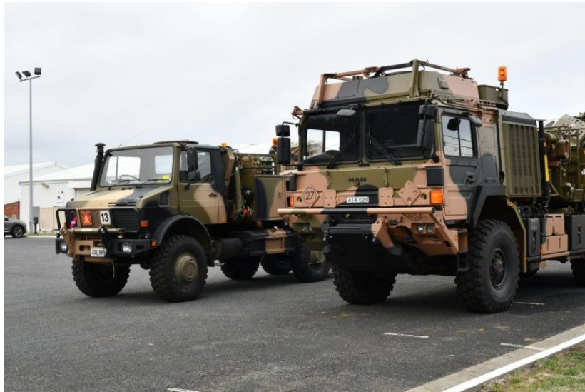
The old and the new