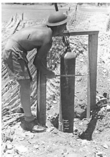
19 Feb 1942: Sounding the general alarm at the Darwin-based 14th Australian Heavy Anti-Aircraft Battery, RAA.

A number of AAOC Workshop elements were in Darwin at the time of the initial bombing attacks and it is possible a spotter from 23 Independent Brigade Group Workshop was one of the first to report Japanese aircraft over the town.