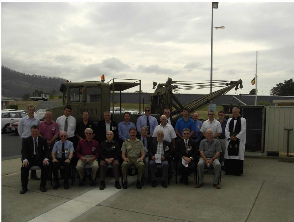
Inaugural Remembrance day January 2006