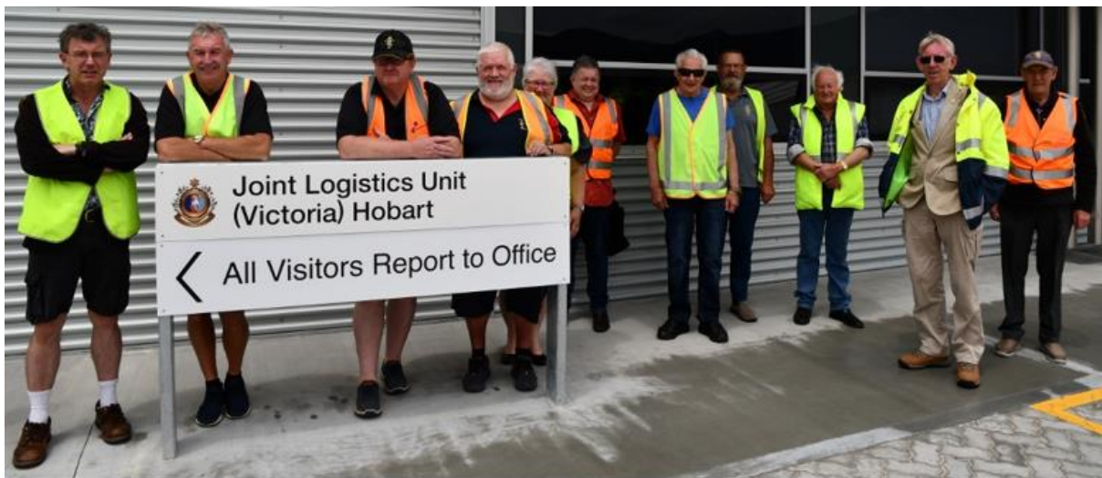
RAT members Gp 2