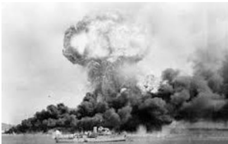
Fuel storage tanks burning in Darwin after the first Japanese air raid.

A number of AAOC Workshop elements were in Darwin at the time of the initial bombing attacks and it is possible a spotter from 23 Independent Brigade Group Workshop was one of the first to report Japanese aircraft over the town.