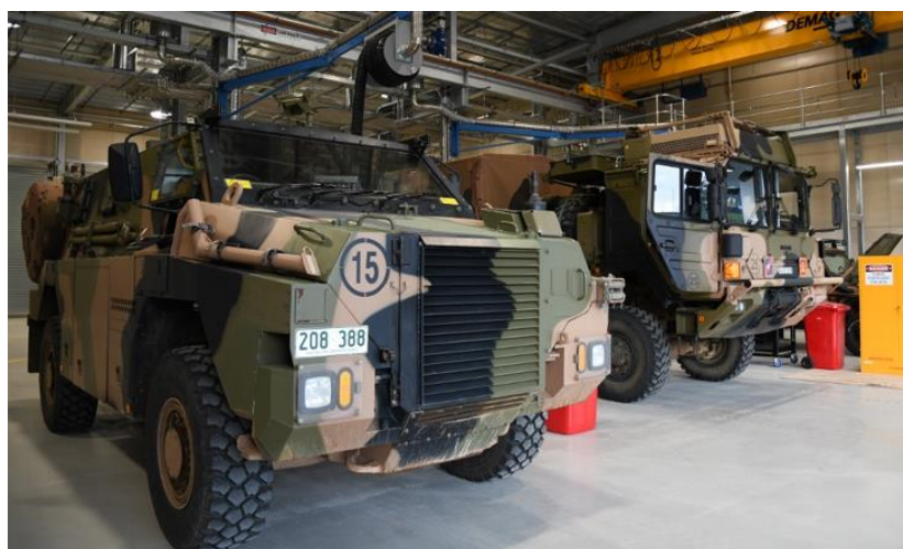
Inside JLUV Wksp

To view more photos of the tour simply access our website gallery, Birthday 2022 .