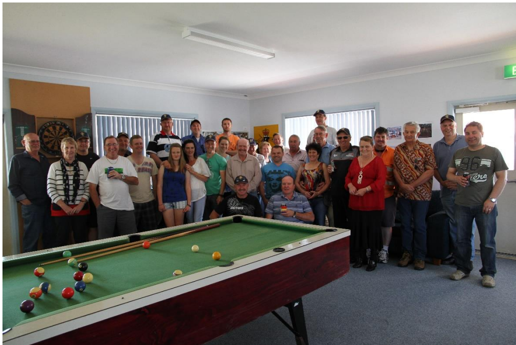
RAEME birthday 2012