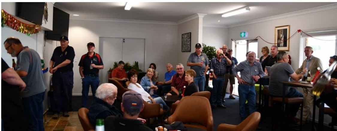
RATs assembled at "The Lair"