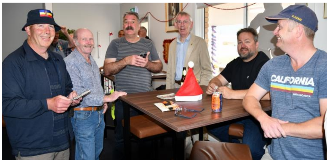
Whose shout is it?