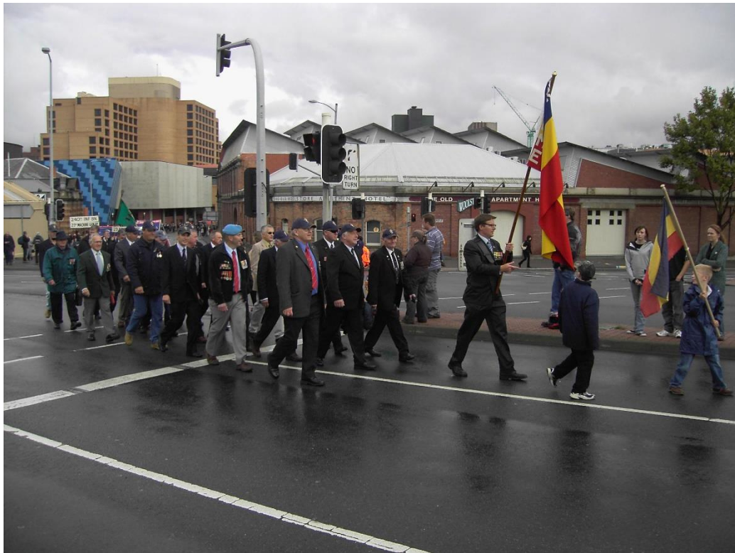
Anzac day Hobart 2009