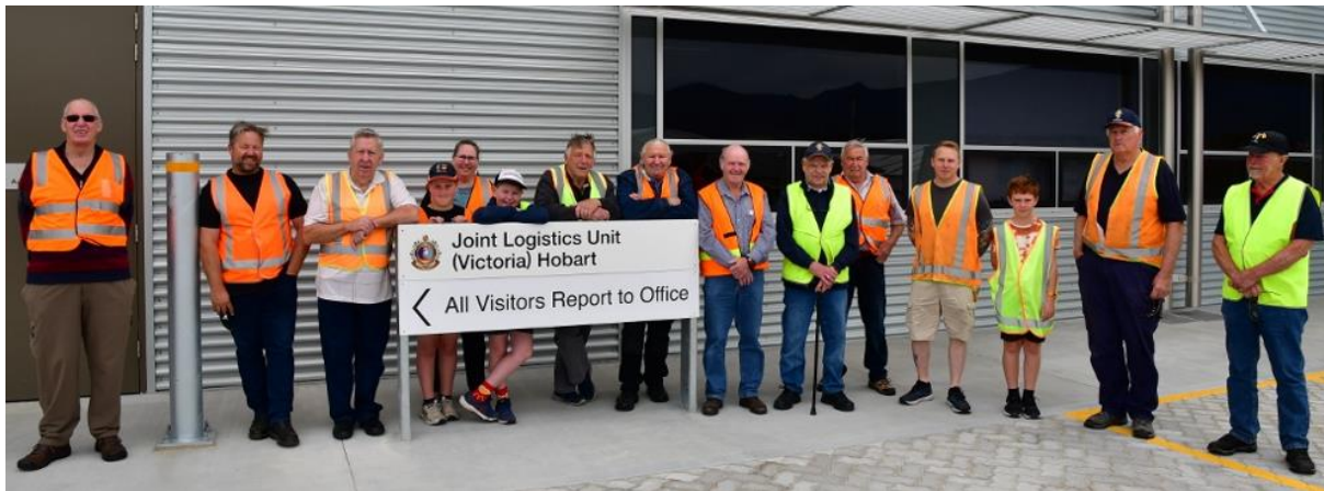
RAT members Gp 1