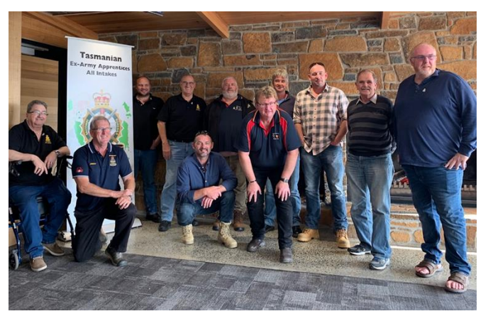
Ex-Army Apprentices at Mienna Great Lakes

https://www.facebook.com/groups/2988296 60299171