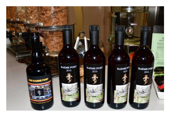
A selection of Corp port for the night