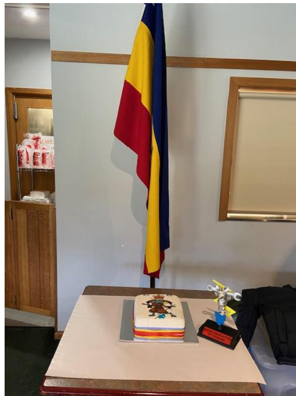
Birthday cake 2025