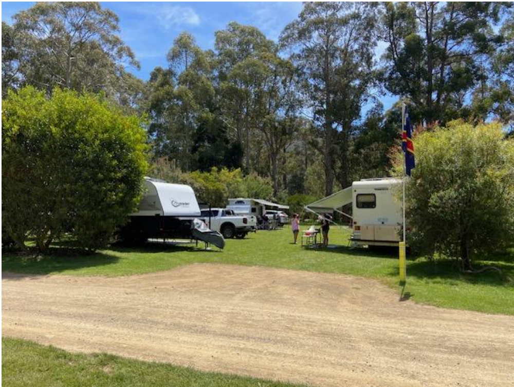
One of the sites at Rivers Edge Camping Ground