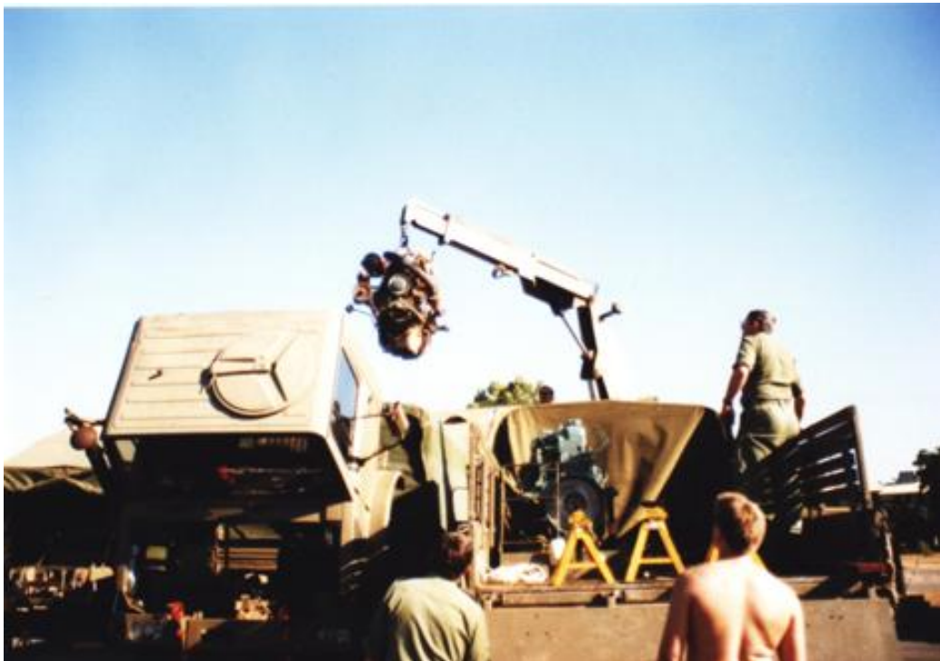
Engine change FRG 301 Fd Wksp K89