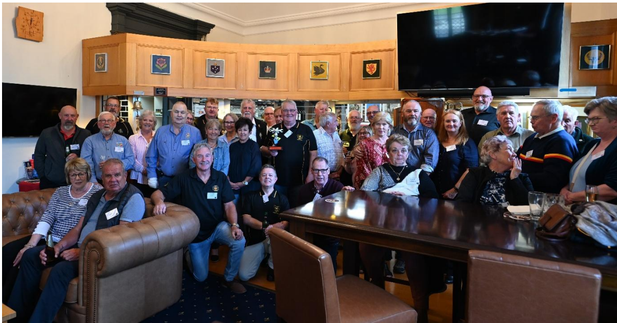
Members assembled Sir

The night also included the introduction of our new RAT mascot, yet to be named, there is more on this further in the newsletter.