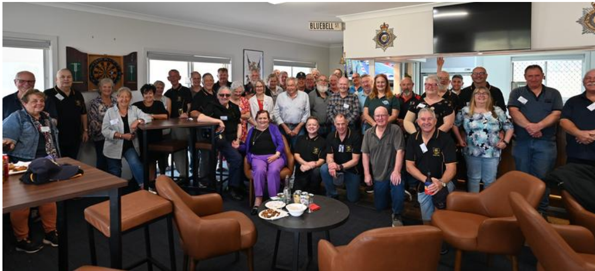
Gathering at Bluebell St