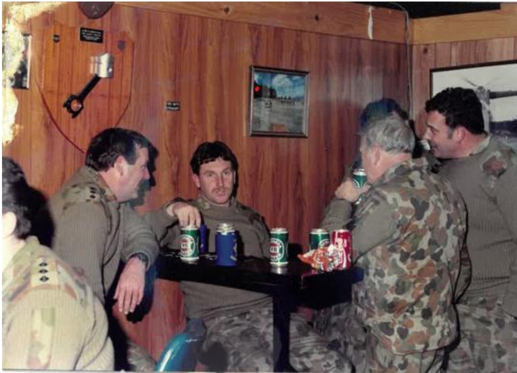
In deep discussion in the Booza circa 1990s