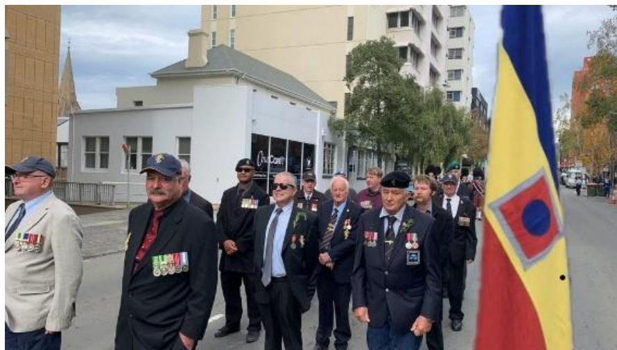
Hmm our Corp flag was there?