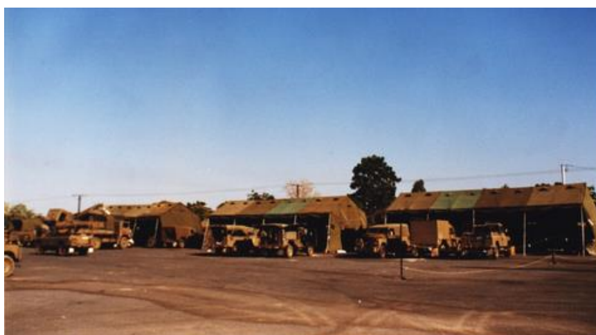
FRG 301 Fd Wksp K89 Darwin