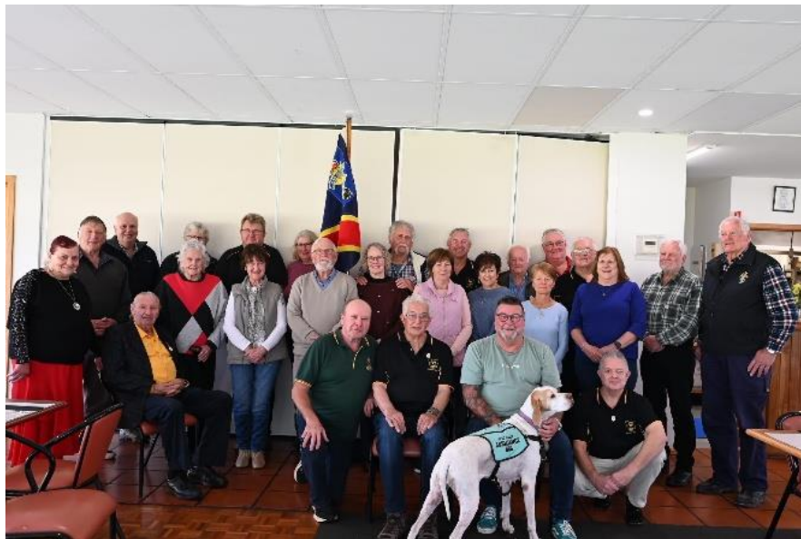
RATS and partners assembled