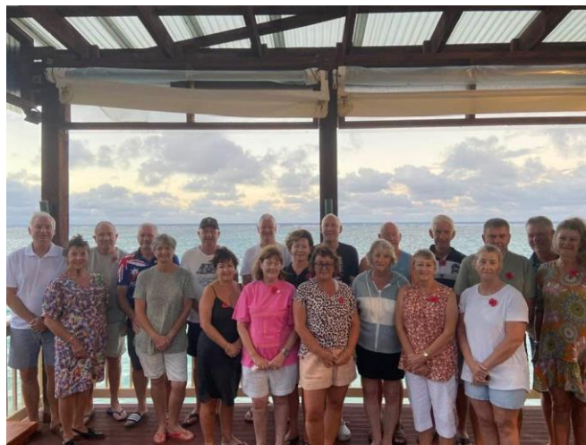
Cook Island Dawn Service

This year I was at the Cook Islands celebrating a 70 th birthday with one of my friends. All who attended the birthday assembled for the Dawn service at our Resort which was followed by a Cannon fire breakfast.